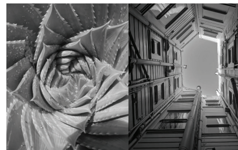
Artwork by Francis Posega Rappleye '17

Milk Photo Center. Traditionally presented in analog form using darkroom materials, this year's exhibition was presented in digital format at harveymilkphotocenter.org .